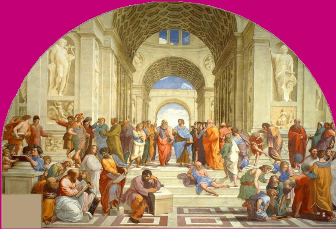
THE SCHOOL OF ATHENS. Raffaello Sanzio. 1510-1511