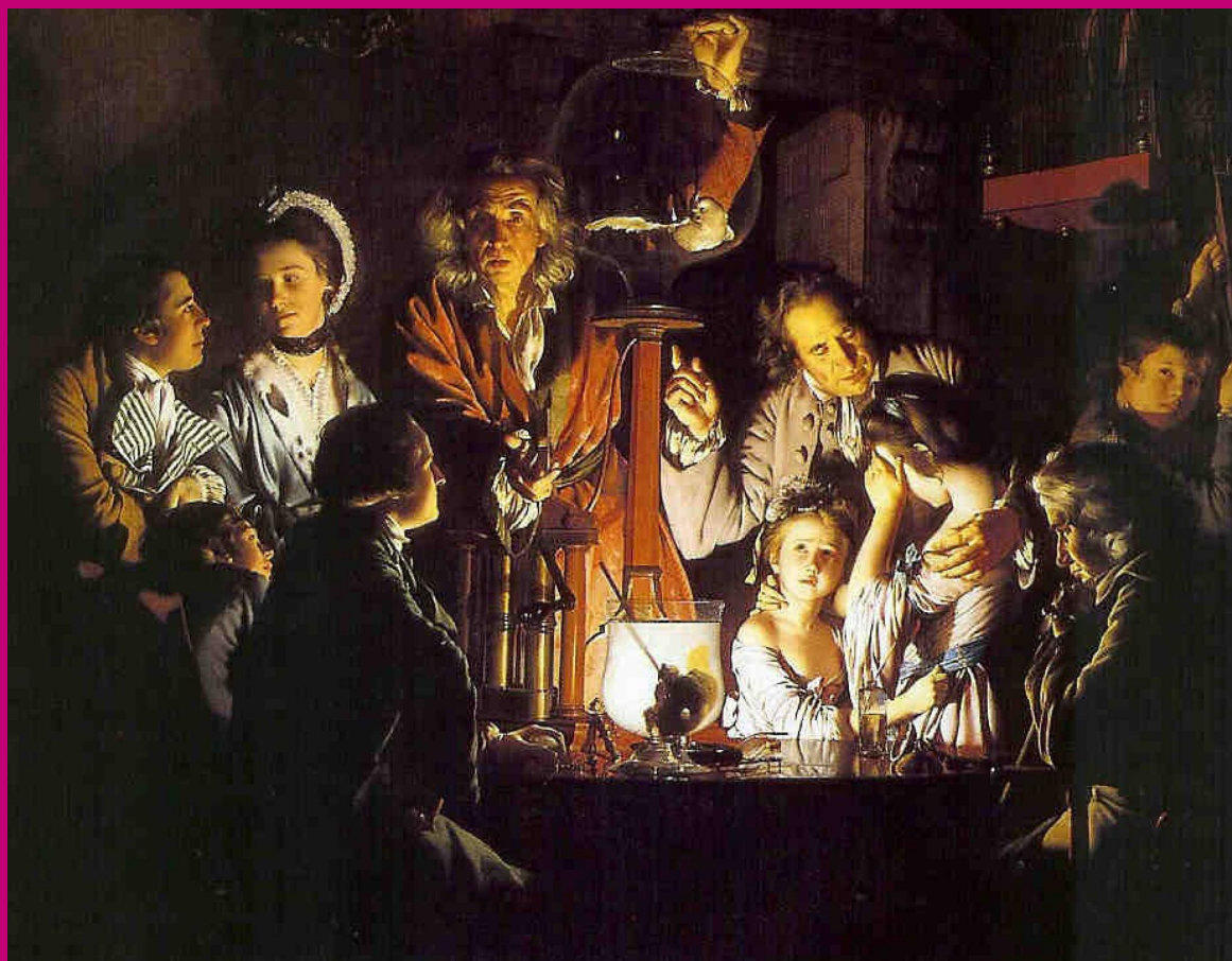
Joseph Wright of Derby. An Experiment on a Bird with an Air-Pump (1768). Oil on canvas, 183 × 244 cm. National Gallery London.