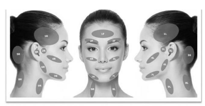
Fig. 1. Question 56 from anamnestic questionnaire DC for Bruxism - Anamnesis ITA (version 1.2).