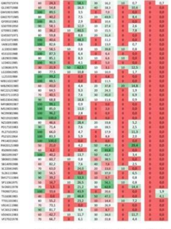
83,5 64,6 2,8 14,2 12,5 17,9 1,7 8,3 8,1 8,2

obtained from the self-assessment questionnaire completed before starting to use BruxApp® is graphically shown below (Fig.2). From the data obtained from the questionnaire, it was possible to calculate the prevalence of AB in the sample equal to 30.1% (25 subjects with self-report AB \ge 3 on the scale from 1 to 10). After that, the averages of the 6 percentage values of BruxApp® are calculated, and the results are the following: 71.7% alert; 50.2% RR; 27.4% SM; 17.5% CD; 4.8% SD; 0% DD. Therefore, the total value of AB for both AB+ (anamnestic self-assessment parameter on the presence of AB) and the total sample is 49.8% and 35.4%.