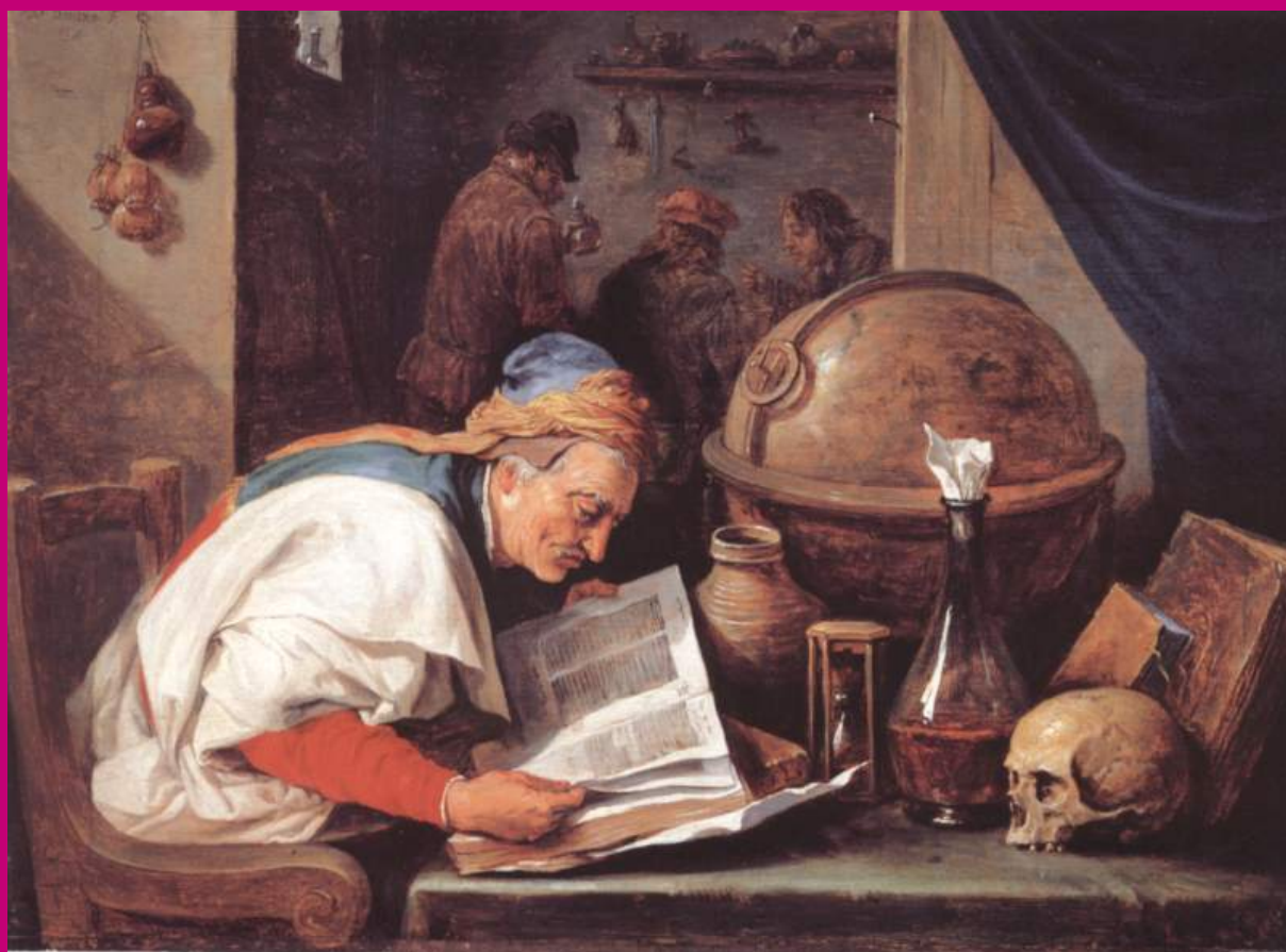
David Teniers (1610-1690) The Alchemist (1680)