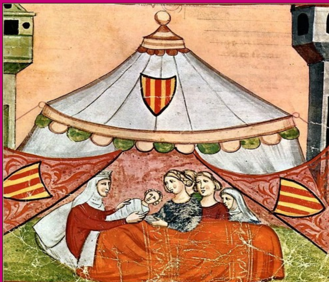
Nascita di Federico II — Stralorio dal codice Chigi L. VIII 296 (Biblioteca Vaticana)