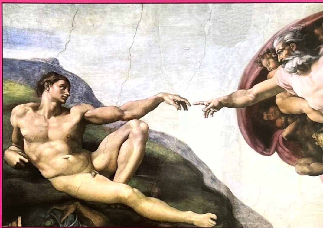
Michelangelo "La creazione di Adamo"