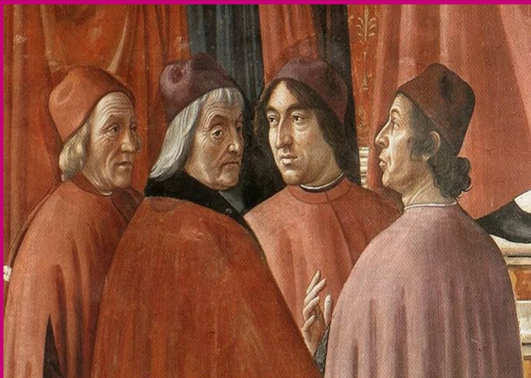
Scholars of the Renaissance, including the Greek academic Demetrios Chalkondyles. Credit: Domenico Ghirlandaio/ Wikimedia Commons