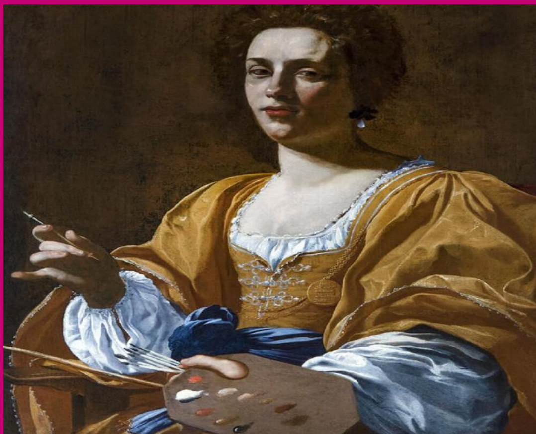
Simon Vouet, Ritratto di Artemisia Gentileschi (1623 circa; olio su tela, 90 x 71 cm; it:Pisa, Palazzo Blu