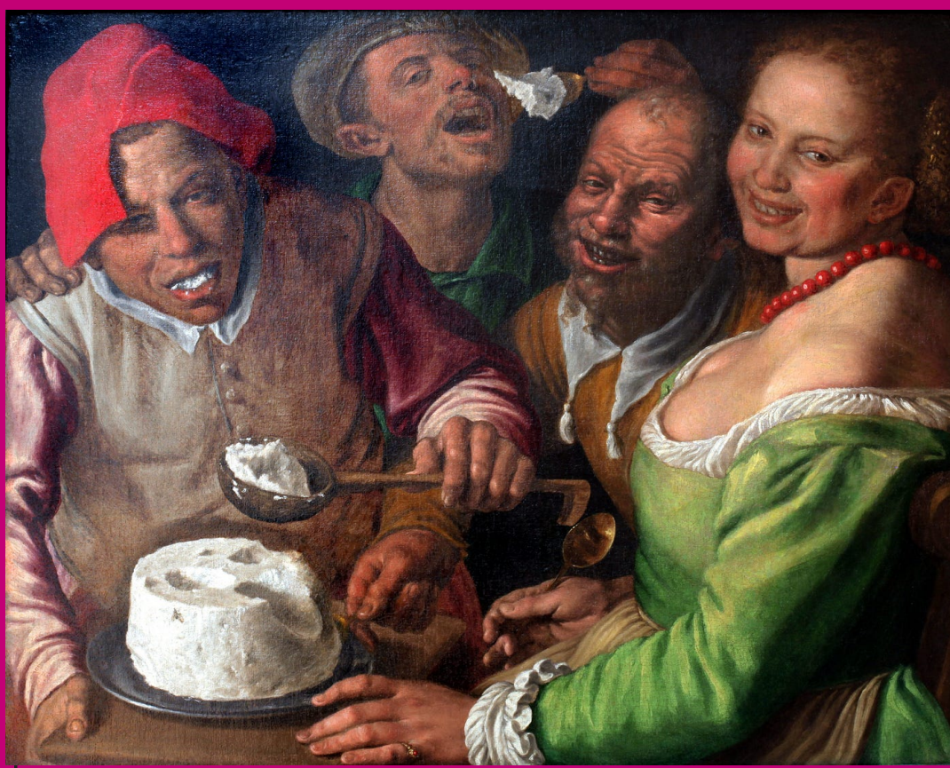
Les mangeurs de ricotta, Vincenzo Campi, ca. 1580, Musée des Beaux-Arts de Lyon, France