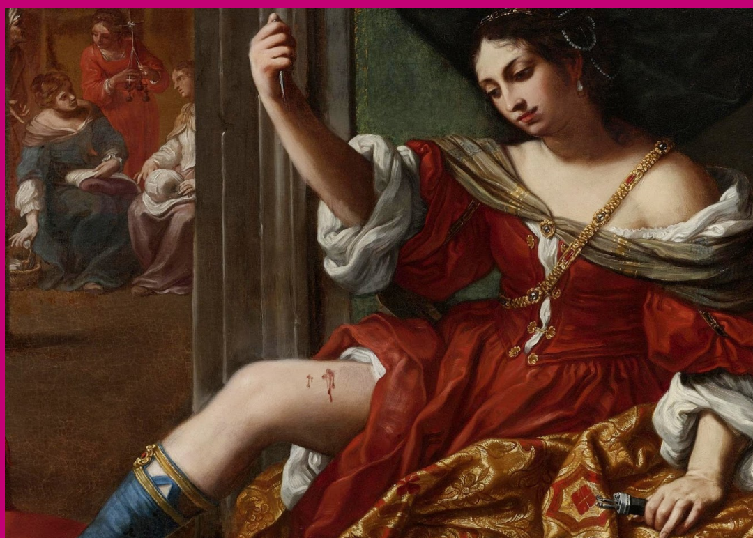
Elisabetta Sirani 1638-1665