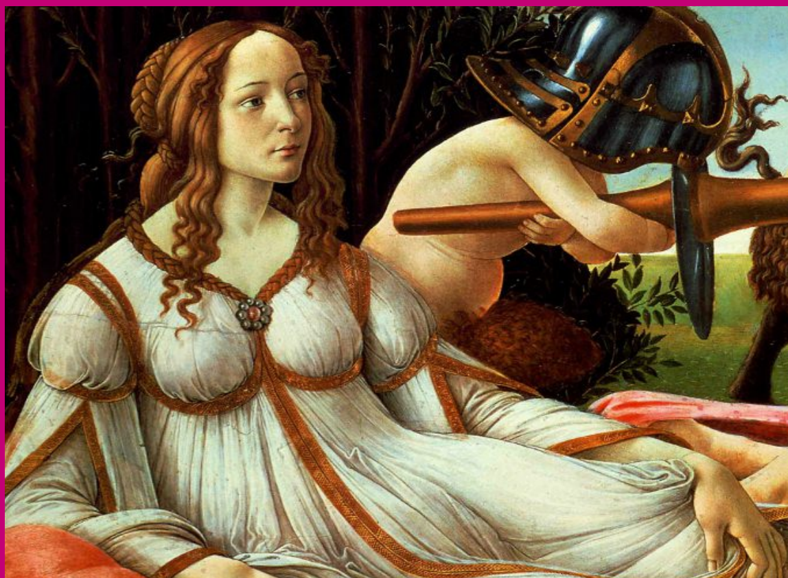
Venus and Mars. (detail c. 1483. Tempera on panel 69 × 173 cm National Gallery, London)