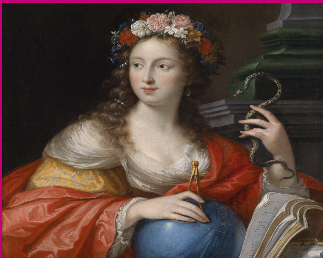
Cesare Dandini 1 October 1596 - 7 February 1657