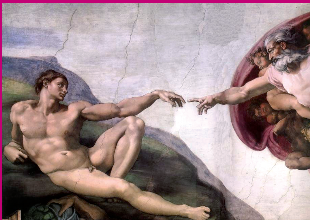
Michelangelo "La creazione di Adamo"