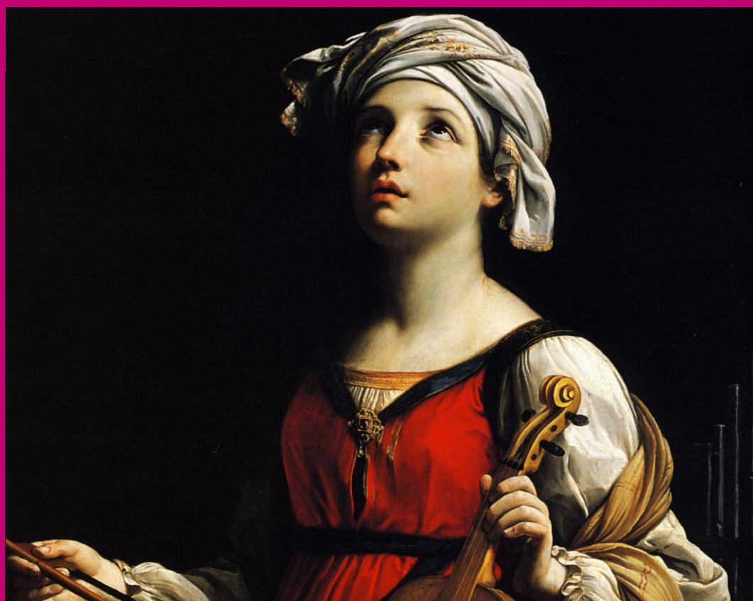
Guido Reni - Saint Cecilia