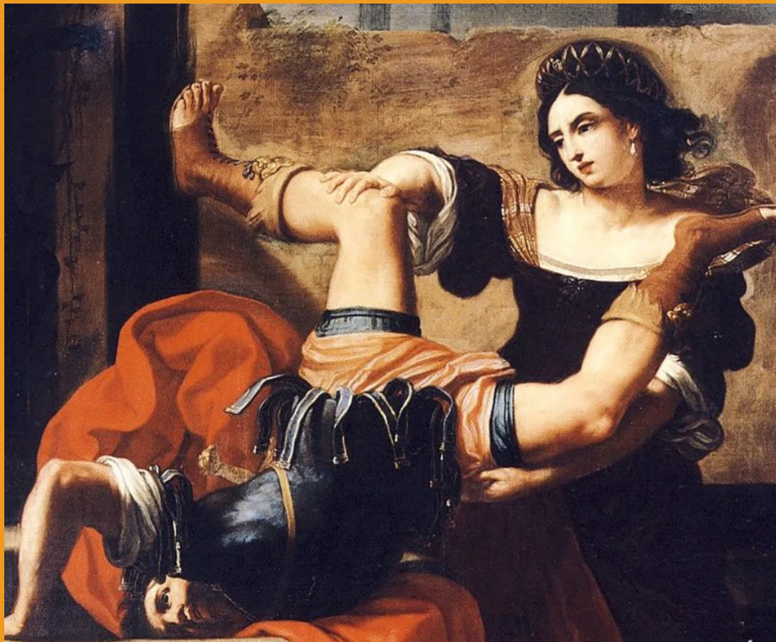
"Timoclea Killing Her Rapist" (1659) by Elisabetta Sirani