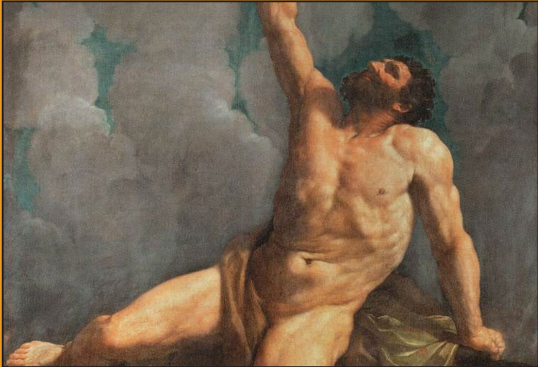
Guido Reni, Hercule sulla Pira (1617), Museo del Louvre, Parigi (detail).