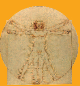
Published by Biolife