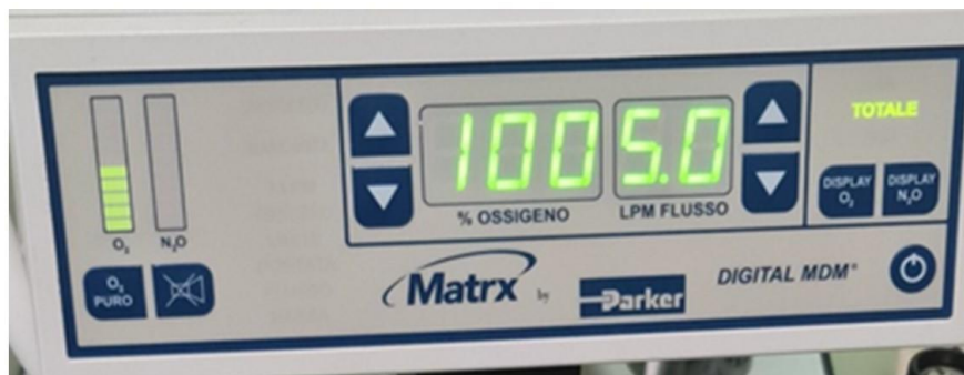
Fig. 3 Control panel that allows the flow rate of oxygen and nitrous oxide to be varied.