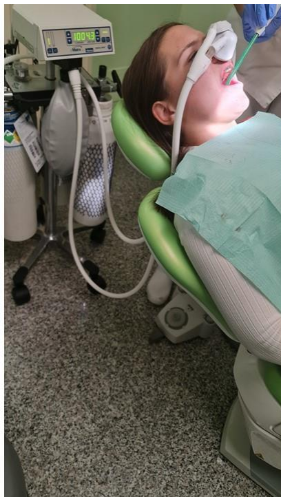
Fig. 2 The patient with correct placement of nasal mask.