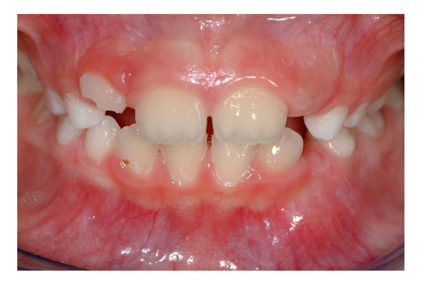
Fig. 1. Intraoral frontal photograph of the patient.

An 8-year-old male with no relevant medical history presented in the Clinic of Odontostomatology of San Sebastiano Hospital, Frascati (Rome) in occasion of a first visit. The young patient had no previous dental consultations. The parents wanted to know how the processes of growth and teeth changes was progressing. The clinical examination did not highlight any pathological aspects related to hard and soft tissues. (Fig.1).